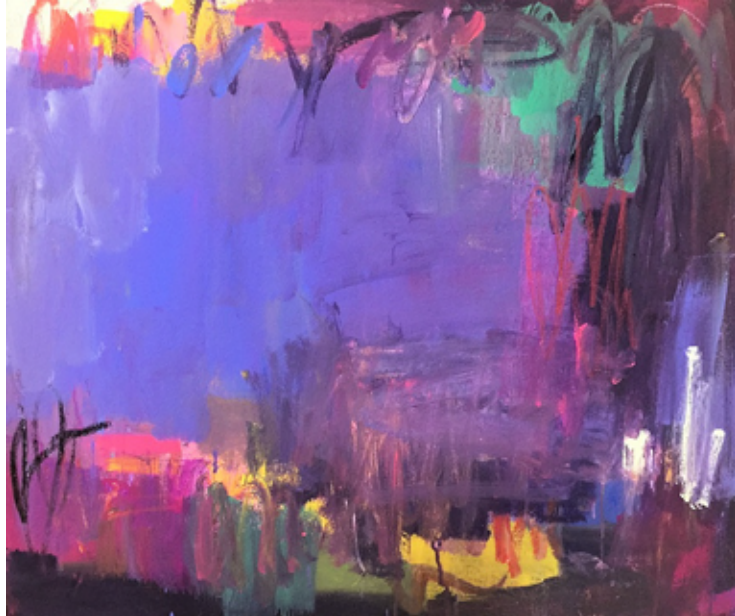
The Sun Will Be UP/陽は昇る 72.2×60.6cm アクリル、パステル、キャンパス(2016)