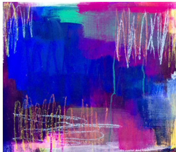
Tranquility/静けさ 45.5×38.0cm アクリル、パステル、キャンパス(2017)