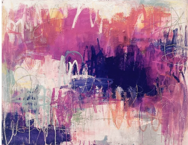
Jazz 116.7×91.0cm アクリル、パステル、キャンパス(2017)